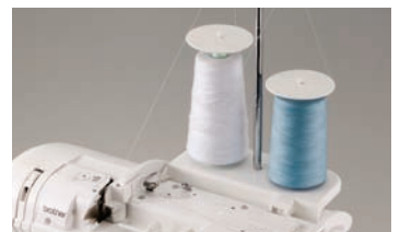
2-pin spool stand Detachable large 2-pin spool stand for large spool thread delivery or easy twin needle sewing.