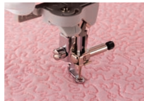
Free Motion "C" foot For beautiful straight-stitch stippling.

Includes three new free-motion presser feet and 2-pin spool stand