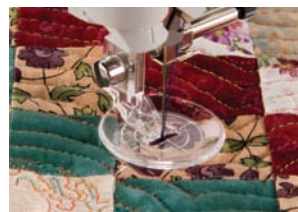
Echo "E" foot For perfect Echo quilting.