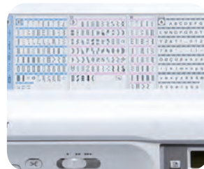
Quick reference panel to easily see all 294 stitches.