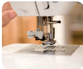
Easy automatic needle threading.