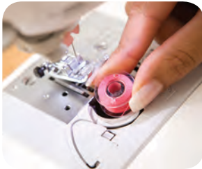
Just drop in a full bobbin and you are ready to sew.