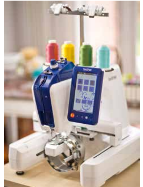
Cap frame shown is an additional purchase.

More creation, less work - the bobbin sensor will tell you when the thread is broken or has run out. While easy access lets you change the lower bobbin without removing your project.