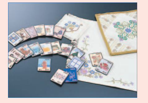
Embroidery Card Library Hundreds of fabulous embroidery patterns to choose from!

Embroidery frames 20mm x 60mm and 100mm X 100mm