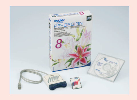
PE-Design* & PE-Design Lite Brother's family of embroidery design software, PED-Light and PE-Design, offer powerful features to suit both beginners and professionals alike.

Large collection of high quality embroidery threads. Metallic and flesh tone threads are included.