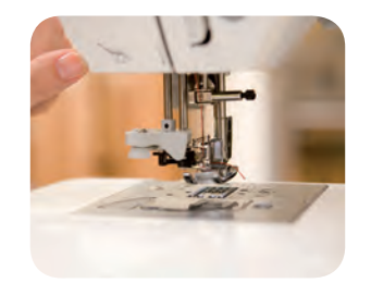
Easy automatic needle threading.