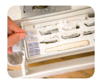
Accessory compartment comfortably holds all the included accessories.

Choose from 294 utility and decorative stitches including 10 buttonhole styles and 3 lettering styles.