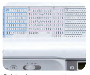
Quick reference panel to easily see all 294 stitches.