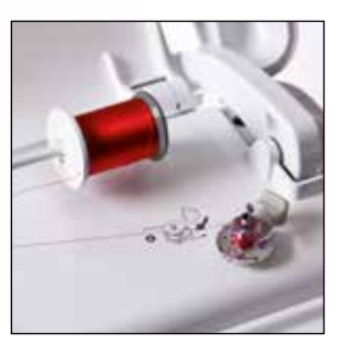
Independent bobbin winding

Simply drop in a full bobbin and direct the thread through the guide and you are ready to go.