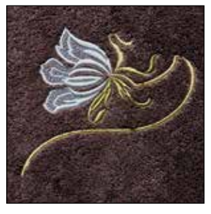
17 built-in fonts and 224 embroidery designs